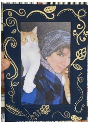
Optional Creativity Club Project

Teens (grades 6-12) can embrace creativity with our new club! The Creativity Club will meet from 2-3 p.m. Tuesday, April 2, in the downstairs meeting room.