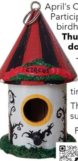
Or Scan The QR Code

For information, contact Emilia at elayne@syracuse.lib.in.us .